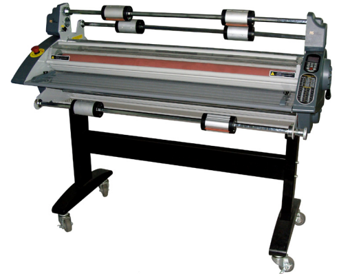
RSH-1651 65” Laminator

5 position lever adjusts the nip between the rollers while springs maintain even pressure during lamination.