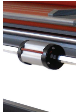
Auto grips to secure film cores to feed and wind up rollers

The RSH-1651 is a high quality, high performance dual hot & cold laminator specifically designed for users to easily and professionally finish wide format graphics. Built for safety and ease of use, this sturdy machine is perfect for laminating and mounting graphics up to 65" wide using pressure-sensitive materials and thermal laminating films. It has a durable, sturdy frame construction and requires little assembly and minimal maintenance. Backed by 25 years of experience, the RSH-1651 is a smart option for today's full service graphics shops.