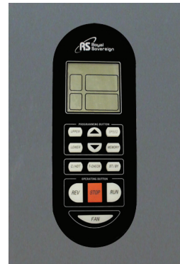
User friendly controls simplify operation